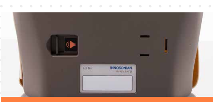
Audible feedback reinforces correct compression depth (Clicker ON/OFF)